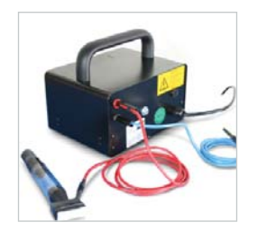
1. Plug In the leads