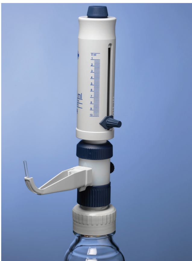
Safety lock feature – cannula turns 180°