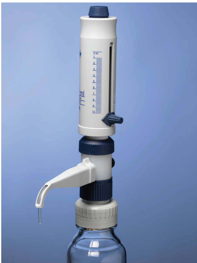
Normal dispensing mode