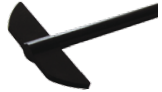
PTFE Coated Paddle (PSNPD series)