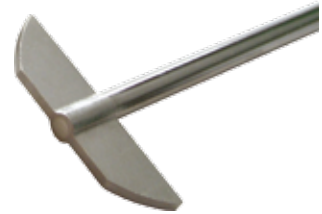
Polished Stainless Steel Paddle (PSEPD series)