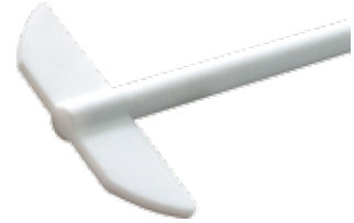
Solid PTFE Paddle (PSTPD series)